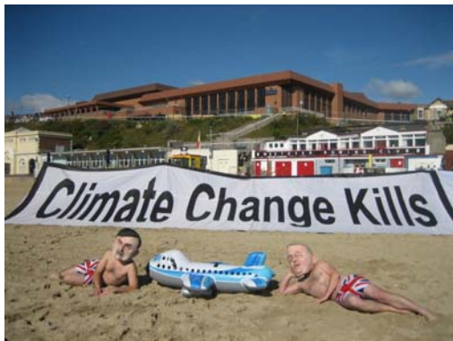
Climate change was the big concern for many of the national organisations in AirportWatch.

For many of the national environmental organisations within AirportWatch, climate change was the big concern. It was the reason they started campaigning on aviation. They saw fighting airport expansion as part of their wider campaign against the threat of climate change. Organisations such as Greenpeace and Friends of the Earth put a huge amount of