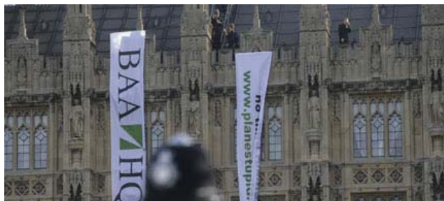
On the last day of the consultation, two days after the rally, Plane Stupid protested on the roof of Parliament Watch them up there: