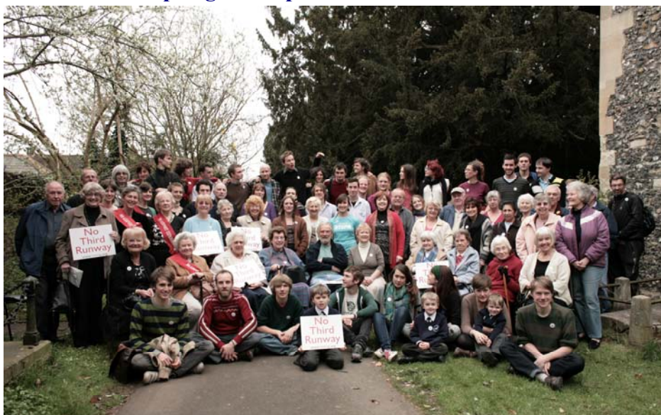
For video of event click Adopt a Resident

Our work revolved around direct action activists getting to know local residents, particularly in the threatened villages in the NoTRAG area. A number of Plane Stupid activists moved into houses in the area and set up direct action training sessions. But they also became part of the community, staging film shows, taking part in local carnivals and regenerating derelict sites (such as the imaginative Grow Heathrow site, cultivated by Transition Heathrow, photo below ). Important friendships were formed. One of the early events where activists and residents got to know each other took place in St Mary's Church Hall, the 11 th century Parish Church in Harmondsworth, where individual residents were 'adopted' by activists. Later in the autumn a Ceilidh – similar to a barn dance – was organised by activists who came down from Scotland. Heathrow residents were being 'adopted' by activists from across the UK. The activists were welcomed into a community which had become worn down by nearly ten years of struggle. Some residents were selling their homes to BAA. There were real fears that the fabric of the community might fall apart. Once again, as after the Climate Camp, activists helped reassure residents they were not on their own. More widely, Heathrow had become such an iconic battle in the fight against climate change that thousands of activists from across the country were ready to descend on the airport if a third runway was not dropped.