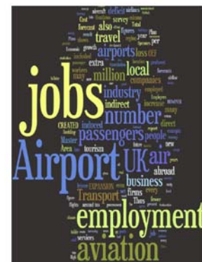
Some reports from AirportWatch have been translated into both French and Dutch.

We were making some headway. We had a memorable, accurate figure; one that challenged the prevailing thinking of the time. We