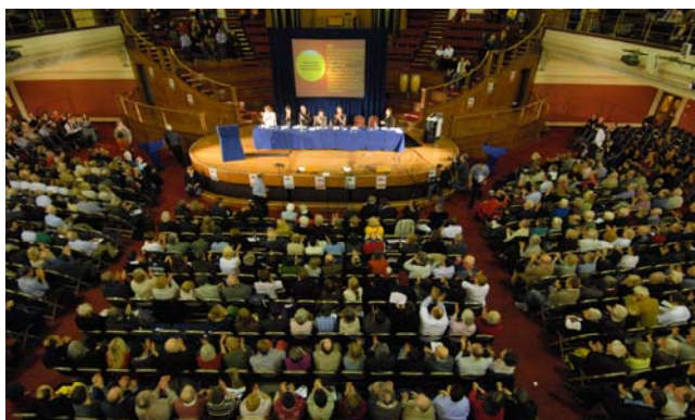
3,000 people poured into Central London for the biggest indoor rally in our history.