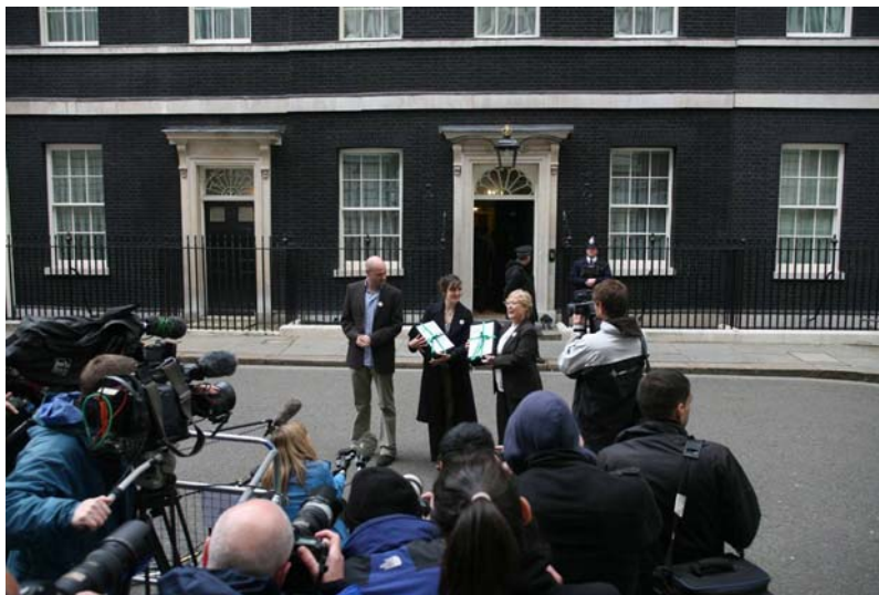
Facing the nation's media