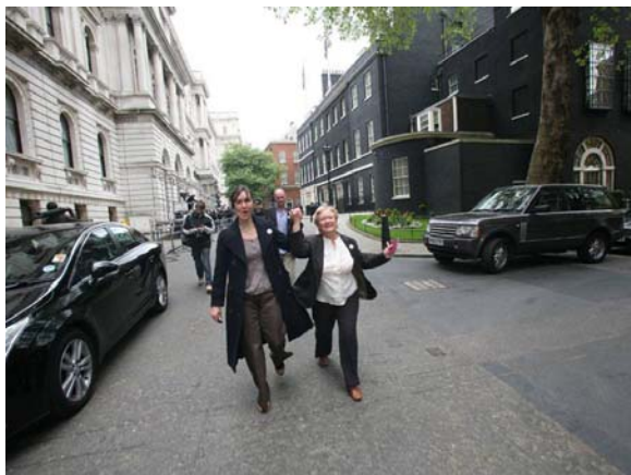
And skipping with sheer joy down Britain's most famous street. We've done it!