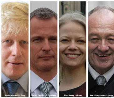
ALL FOUR CANDIDATES FOR LONDON MAYOR OPPOSE A THIRD RUNWAY AT HEATHROW.

They don't agree on much, but they're all against this. Find out why, and what we're doing to stop it. Text 02035 55 4377.