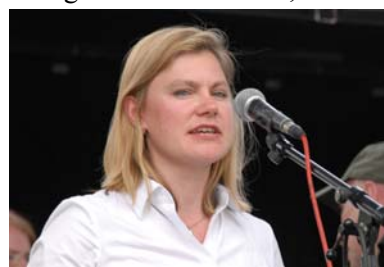
The tenacious Justine Greening, the Conservative MP for Putney, played an important role in the campaign from the early days.

The Liberal Democrats and, not surprisingly, the Green Party had come out firmly against expansion at Heathrow. But, perhaps most interestingly of all, it was becoming clear that there could be some real movement in Conservative Party thinking. David Cameron, the new conservative leader had set up a Quality of Life Commission to look at a range of matters. The members of the Commission were not just drawn from the Conservative Party. They included a number of campaigners from AirportWatch as well as leading lights from the aviation industry. The transport section was chaired by the former transport minister Stephen Norris whom I had known in the 1990s and liked. He had done much to push sustainable transport policies within the Conservative Party. At the Quality of Life meetings it became clear that he saw the sort of airport expansion the Government was envisaging as deeply unsustainable, particularly in the light of its growing impact on climate change. He was opposed to a new runway at Heathrow. The final report of the Quality of Life Commission, though not taken on board as party policy, revealed that new thinking on aviation might well be emerging within the Conservative Party.