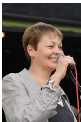
Green Party Leader Caroline Lucas, consistently helpful, spoke at a number of our meetings and rallies.

The coalition organised over 40 public meetings attended by an estimated 20,000 people in total