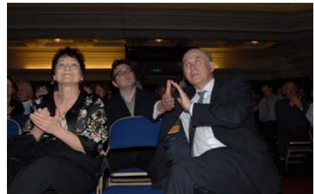
Sarah Ludford and Vincent Cable