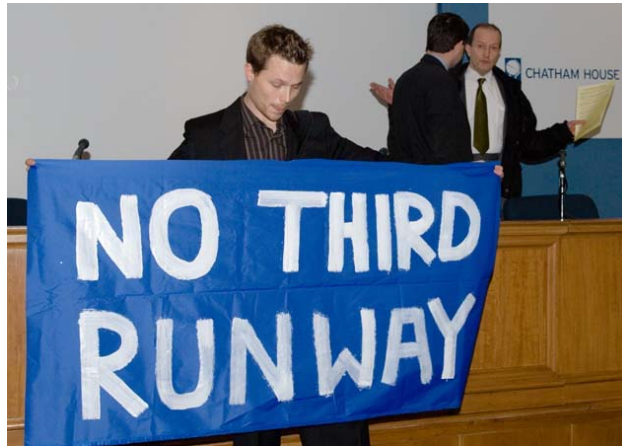
West London residents join Plane Stupid in disrupting aviation conference in Central London.

Plane Stupid became active in the Heathrow campaign. Activists, working alongside Seeds for Change, the organisation which assists community groups, helped train West London residents in direct action. These were local people, including a fair number of HACAN members, who had expressed an interest in taking direct action. The training led to a number of actions, including residents invading a major aviation conference in Central London where the Douglas Alexander, Secretary of State for Transport, was speaking. The purpose of these direct action events was two-fold. It was to put a warning shot across the bows of government that residents were willing to go further than ever before to stop expansion. But it also provided a